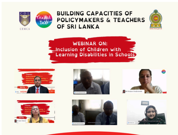
Screenshot from the webinar featuring dignitaries and experts discussing SLDs