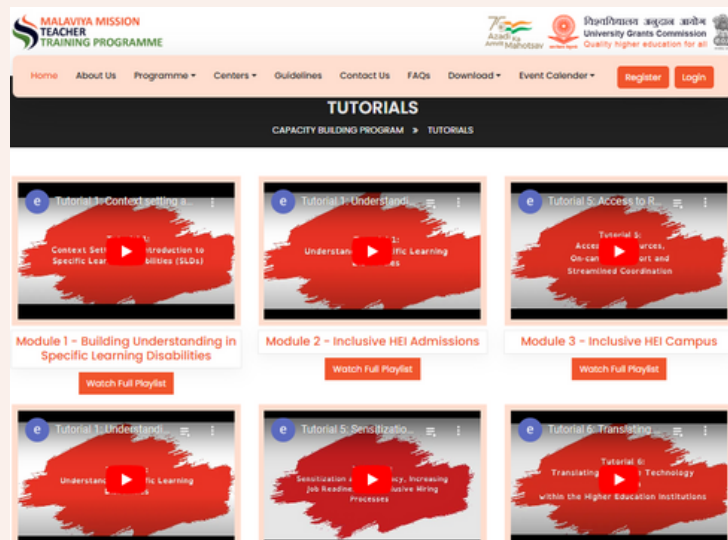
BUILD Tutorials on MMTTP Platform.

https://mmc.ugc.ac.in/LearningDisabilities/Tutorials