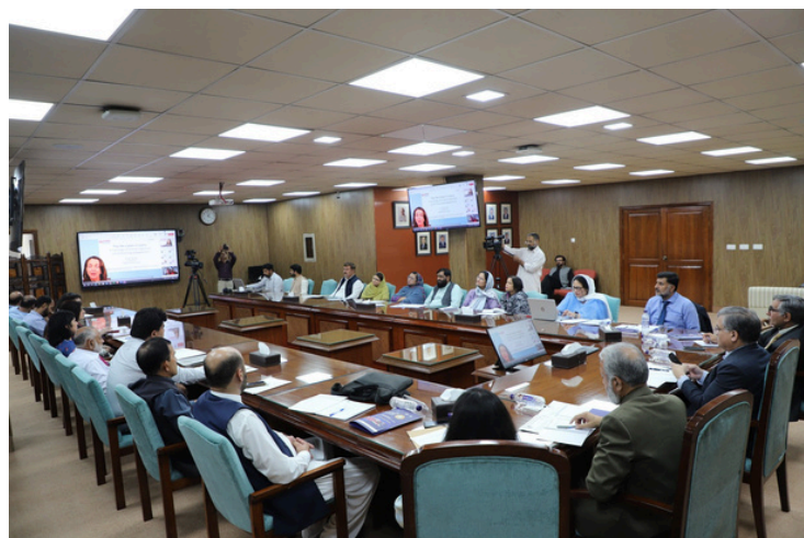
Proceedings at the pre-conference webinar, AIOU Pakistan